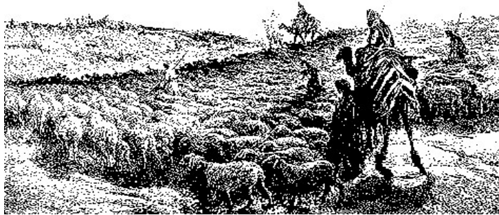
God's plan calls for multiple shepherds working together.

From these verses we can see that during the early Christian era, each local assembly consisted of all the believers in a city and each had a team of men appointed as elders who provided the assembly with pastoral oversight. There is no indication that any one elder ruled over the others. Instead, the elders worked together as colleagues. Their responsibilities included ruling (or leading) the assembling, laboring among the people, admonishing the people, speaking the Word of God to the people, watching over the spiritual lives of the people, and praying for those who were sick.